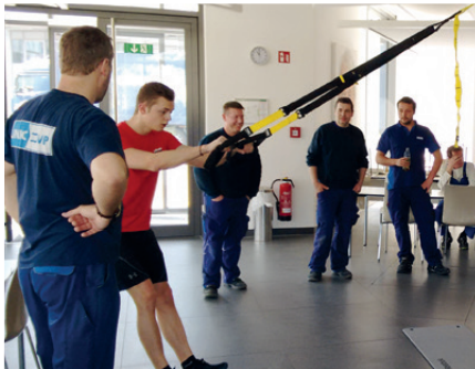
Staff trying out the TRX.

health day to bring better awareness to our employees.