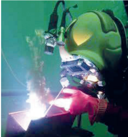
Underwater work being carried out by the hearing impaired.

Singapore Yacht Club on Saturday, 21st May 2016 where close to 30 participants from the local handicap welfare association, various nature societies and members of the local commercial diving fraternity attended.