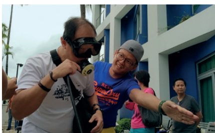
A hearing impaired participant trying out a breathing equipment.