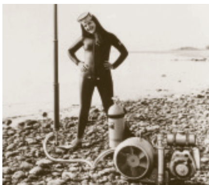
A diver with a portable BAUER compressor.

1954 saw BAUER's sales first overtaking the magic million mark. Profits were invested in new production facilities and expanding the product range.