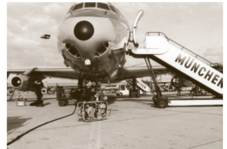
A BAUER high-pressure compressor at Munich Airport delivers the air required to start up the turbines.

The original customer had withdrawn in the meantime – but events proved