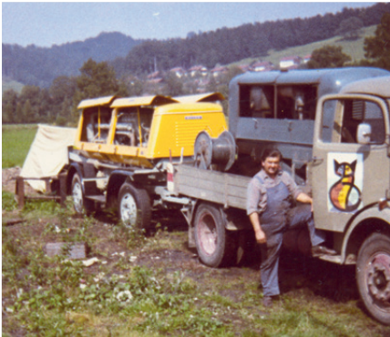
The LD 12 mobile compressors can cope even in rough terrain.

The first mobile diesel compressors were produced in 1955.