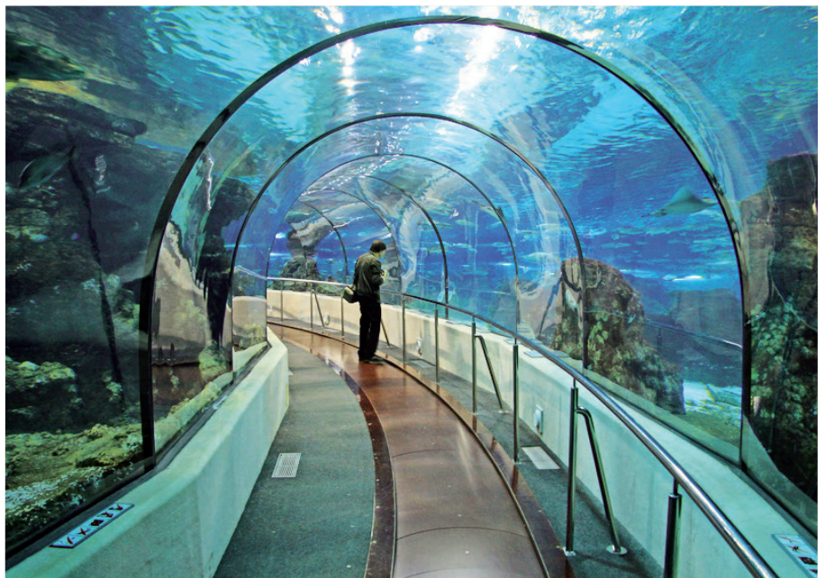
European record: An 80-metre glass tunnel runs through the 'Oceanarium', the largest aquarium at 'L'Aquàrium.'

Barcelona's famous 'L'Aquàrium' relies on a BAUER KOMPRESSOREN's system when it comes to the breathing air supply of its divers.