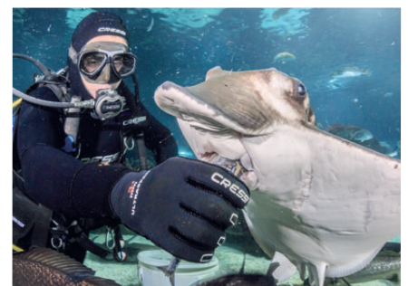
A diver, shown here making an acquaintance with a manta ray, uses BAUER pure breathing air.

'Oceanarium', an aquarium containing an incredible four million litres of water where sharks, rays and moray eels glide to and fro and shoals of fish dart elegantly past. Limited numbers of especially bold visitors can sign up for a diving