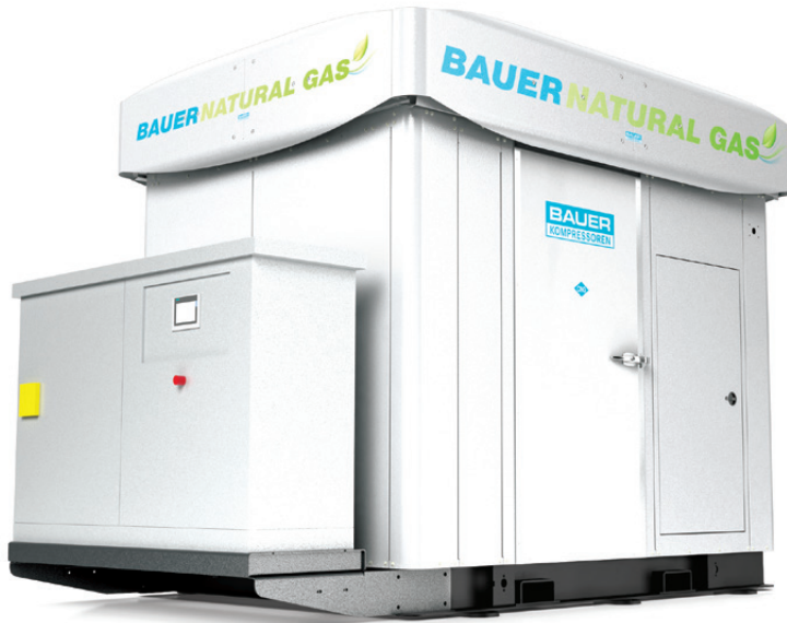
The new M-SERIES – tailored to the requirements of the European CNG market.

what is left behind is organic manure (fertiliser) which is rich in nutrients & is therefore in high demand for agricultural use.