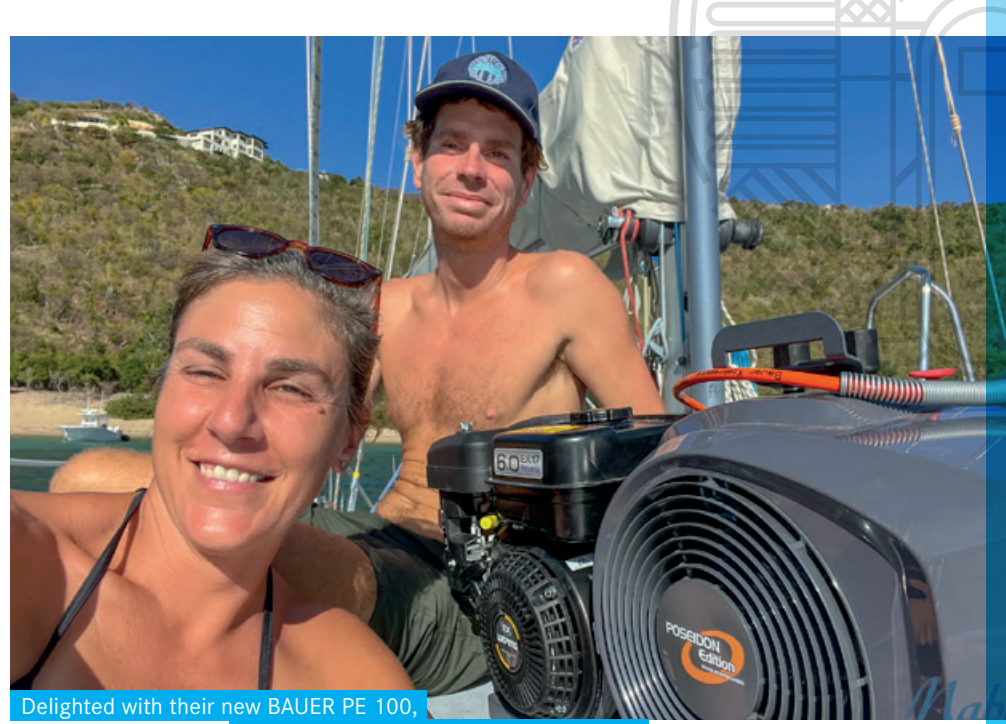
the team can finally now go underwater!

The FireFit Championships Europe are where the toughest members of the firefighting sector pit their strength over an incredibly challenging course of