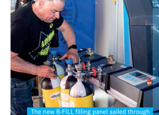
its first continuous challenge